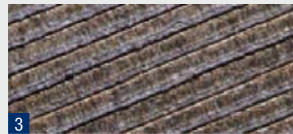
New varnish, no squeezing